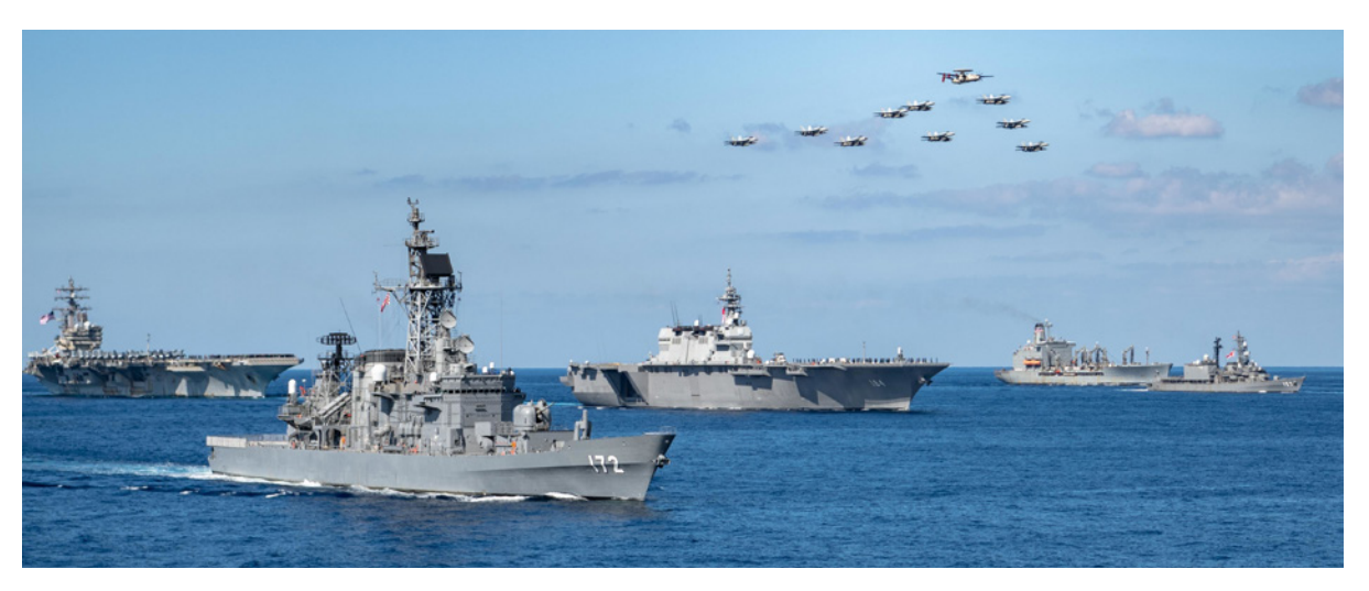
The Ronald Reagan Carrier Strike Group, Japan Maritime Self-Defense Force, and Royal Canadian Navy participate in Exercise Keen Sword 21.

Complementing our forces closest to the threat, Naval Service warships will exploit our control of the seas. Maneuverable strike forces—composed of multiple carrier strike groups, surface action groups, and expeditionary strike groups, and augmented by unmanned platforms—will launch overpowering air and missile attacks from unexpected directions. Our long-range systems and hypersonic weapons will provide global strike capabilities against targets ashore. Logistics and auxiliary ships will surge to establish refueling, rearming, resupply, revive, and repair points. The Coast Guard will ensure the safe, secure, and efficient marine transportation system essential to sustaining forces in war.