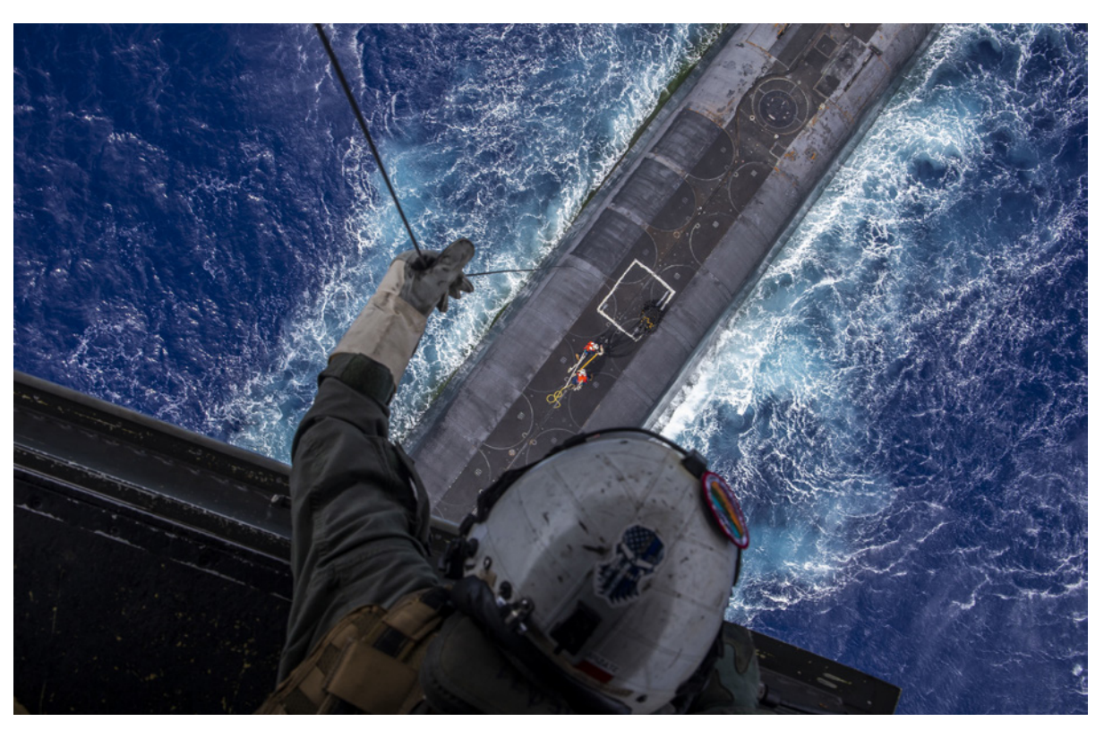
U.S. Marine Corps aircrew lowers material from an MV-22B Osprey to the Ohio-class ballistic-missile submarine USS Henry M. Jackson (SSBN 730) in the vicinity of the Hawaiian Islands in 2020. Underway replenishment sustains the fleet anywhere and anytime.

Shore readiness. Shore readiness supports warfighting and operational readiness by enabling the manning, training, and equipping of naval forces. We will prioritize investments that most directly support fleet operations and readiness, support basing and maintenance for current and future platforms, enable research and development, and provide continuity of C5ISR.