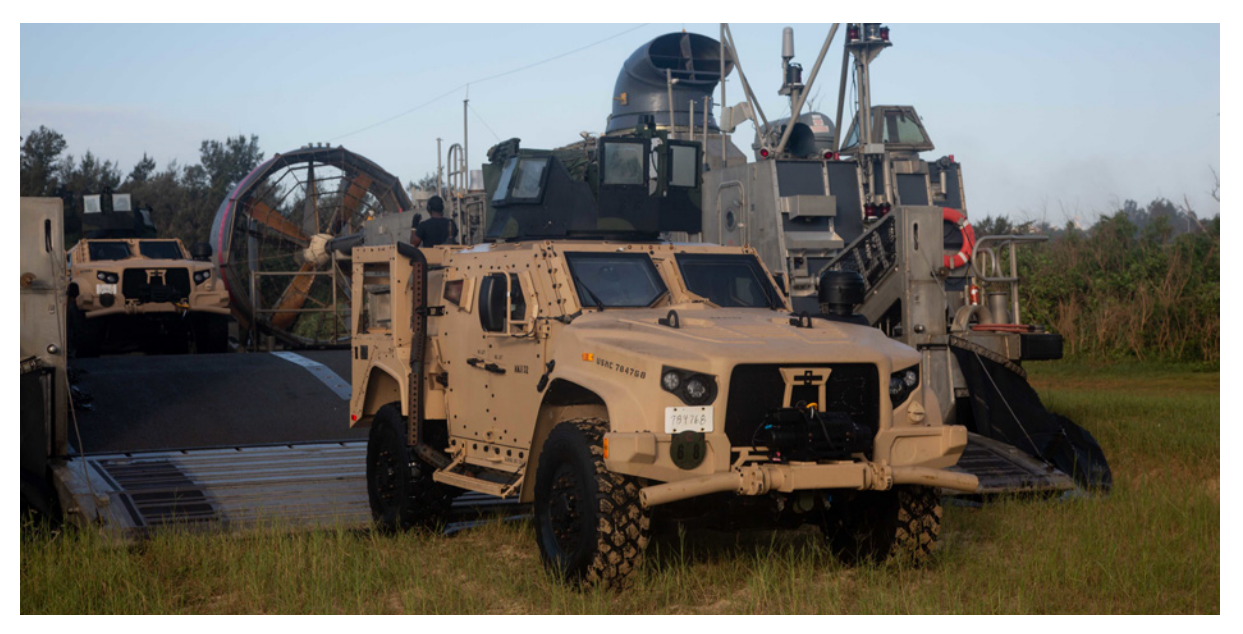
U.S. Marines offload joint light tactical vehicles from a U.S. Navy air cushioned landing craft in Okinawa, Japan during exercise Noble Fury 21.

Crisis operations require an accurate understanding of the operating environment. Manned and unmanned ISR platforms provide timely indications and warnings of competitors' military preparations, while naval forces—including submarines, surface ships, aircraft, and unmanned systems—gather intelligence from a variety of sources. Emerging technologies will