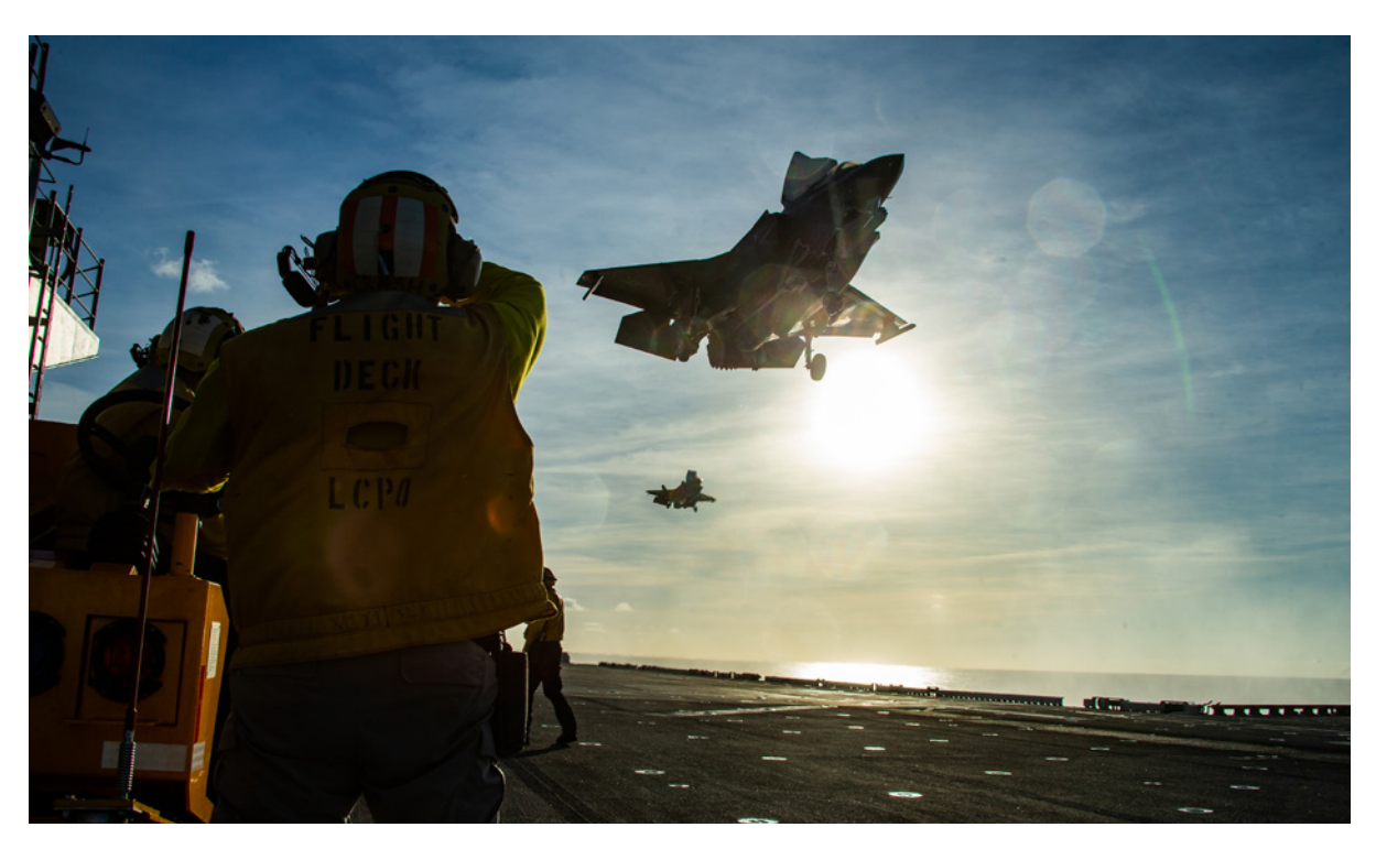
U.S. Marine Corps F-35B Lightning II aircraft land aboard amphibious assault ship USS America (LHA 6) in the Philippine Sea in 2020. These and other new technologies are capable of destroying adversary forces in the most highly contested battlespaces.

enhance global deployability and provide expanded options across the competition continuum. We will resource integrated force generation, with both funding and time, to ensure deploying forces are prepared for a global, all-domain fight. Finally, we will ensure we have the necessary capacity and capability for sealift and logistics to sustain our forces in contested battlespaces.