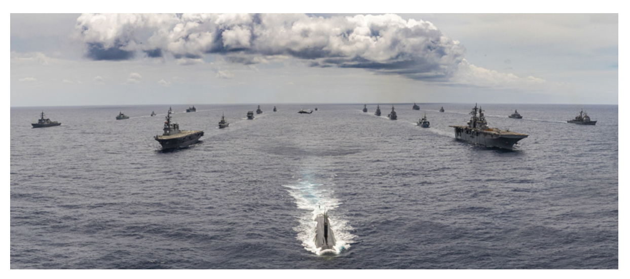
Ten nations, 22 ships, one submarine, and more than 5,300 personnel participate in Exercise Rim of the Pacific (RIMPAC) 2020. The biennial exercise is a unique training platform designed to enhance multinational interoperability and strategic maritime partnerships.

Advantage at Sea provides guidance to the Naval Service for the next decade to prevail across a continuum of competition—composed of interactions with other nations from cooperation to conflict. This strategy emphasizes the following five themes. We must fully