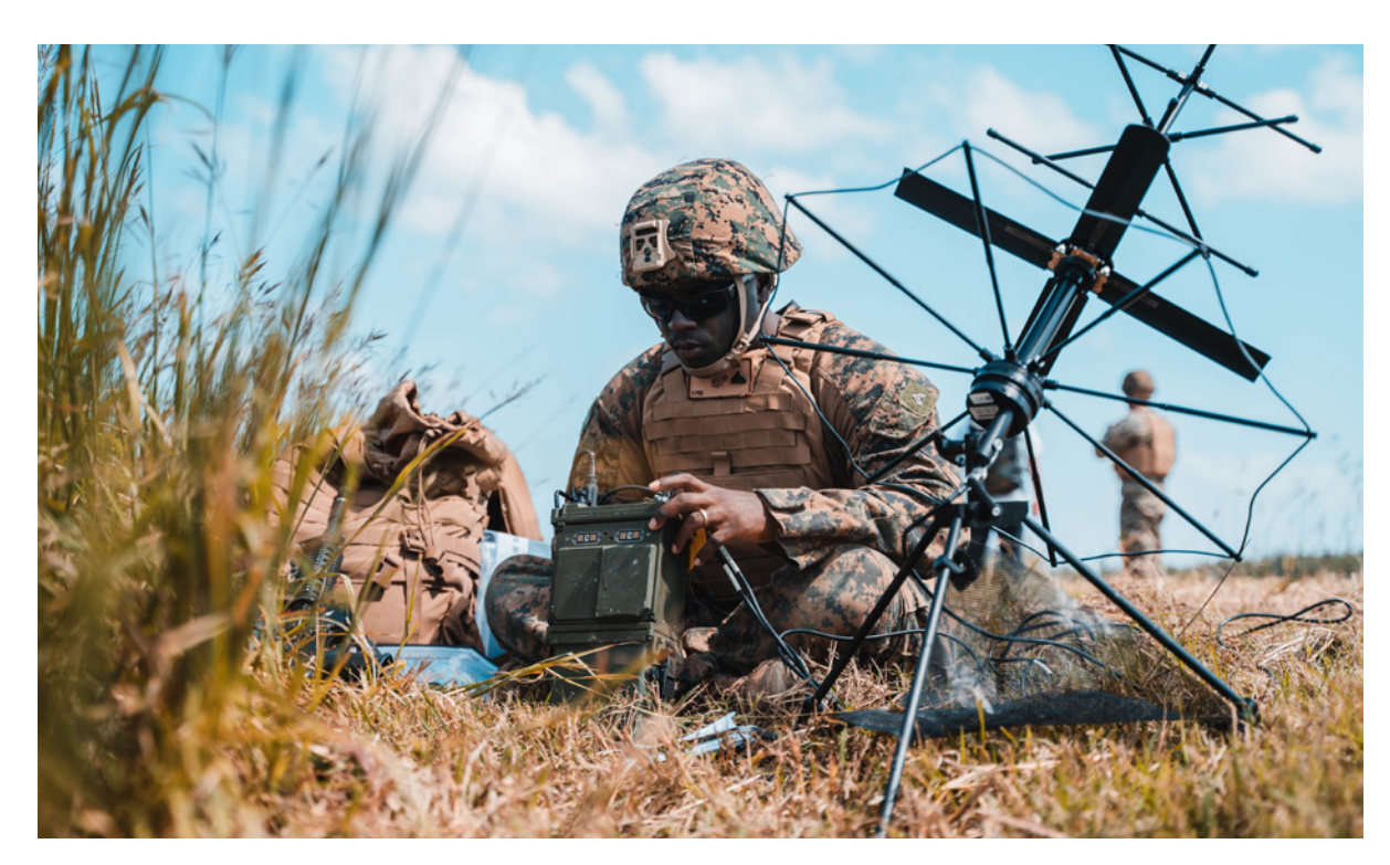
A U.S. Marine Corps radio operator sets up a long-range communication system while demonstrating expeditionary advanced basing capabilities during Exercise Noble Fury 21.

Training and education. Our success in this long-term strategic competition depends upon our Sailors, Marines, and Coast Guardsmen. We will prepare them to be agile and adaptive in an era of rapid change and evolving threats.