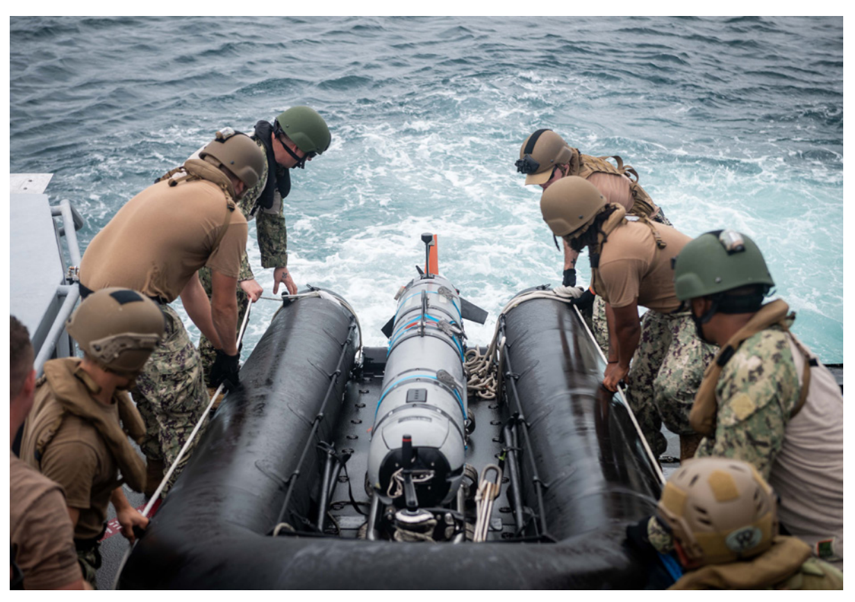
Sailors retrieve a Mark 18 Mod 2 unmanned underwater vehicle during a transit through the Northern Mariana Islands in 2020.

requirements documents that drive our programmatic decisions and place appropriate capacity and capabilities in reserve components to gain efficiencies. These efforts will eliminate duplicative efforts, accelerate our improvements in lethality and survivability, and enable rapid fielding of an improved mix of both high-end and attritable capabilities.