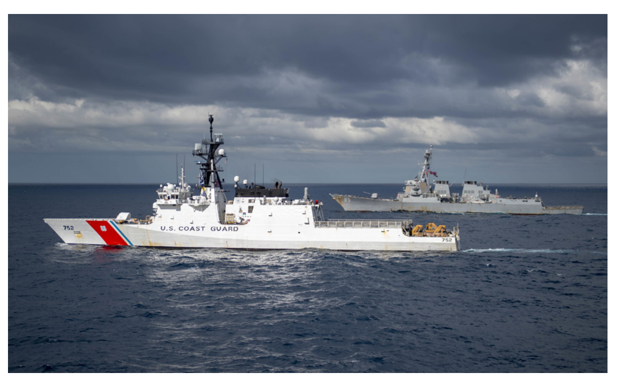
Legend-class cutter USCGC Stratton (WMSL 752) and Arleigh Burke-class guided-missile destroyer USS McCampbell (DDG 85) maneuver in the Coral Sea in 2019.

The Naval Service does not compete, deter, or fight alone. We are an integral part of the Joint Force and work closely with allies, partners, and other government agencies. We are also part of America's broader maritime enterprise, which includes commercial ships, merchant mariners, port infrastructure, and shipbuilders. All of these relationships are paramount to guarantee free use of the maritime domain, ensure our security, and protect our prosperity.