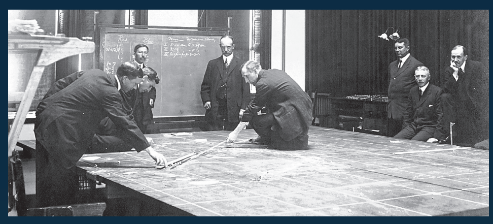
A Naval War Game on the Third Floor of Luce Hall, ca. 1905–1906

The War Gaming Department conducts high quality research, analysis, gaming, and education to support the Naval War College mission, prepare future maritime leaders, and help shape key decisions on the future of the Navy.