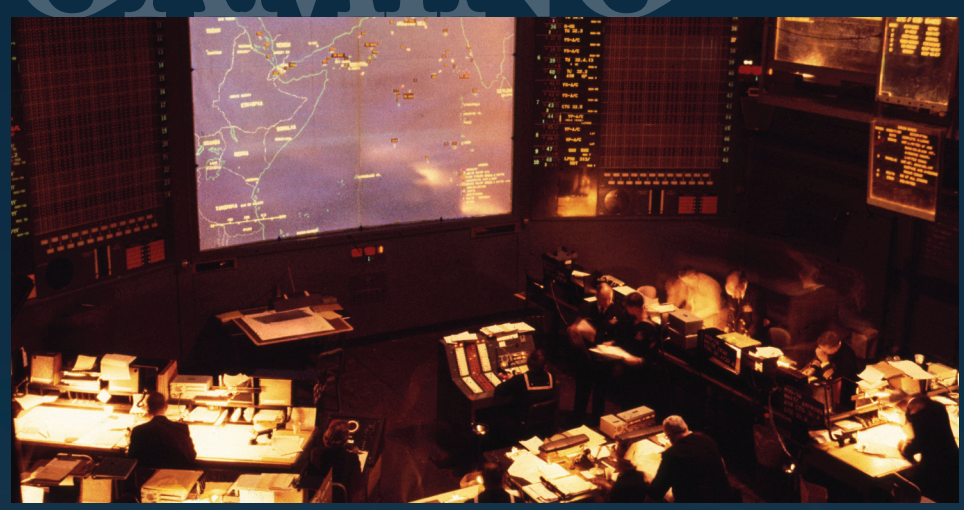
Naval Electronic Warfare Simulator (NEWS), Sims Hall, 1958