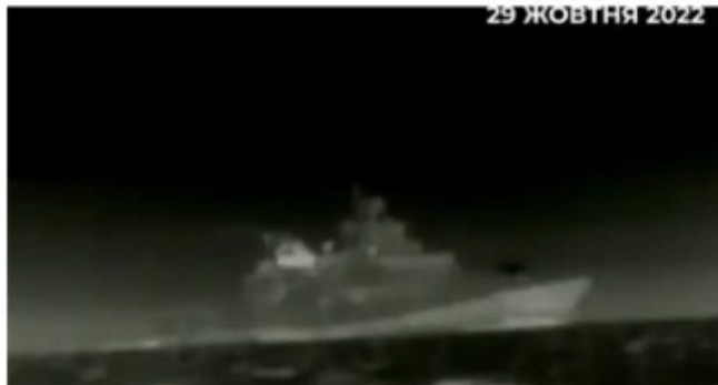
Minutes before the USV attacks to Admiral Grigorovich-class frigate (Screenshot from the footage circulating on social media)

“...a cross between a canoe and a jetski...”