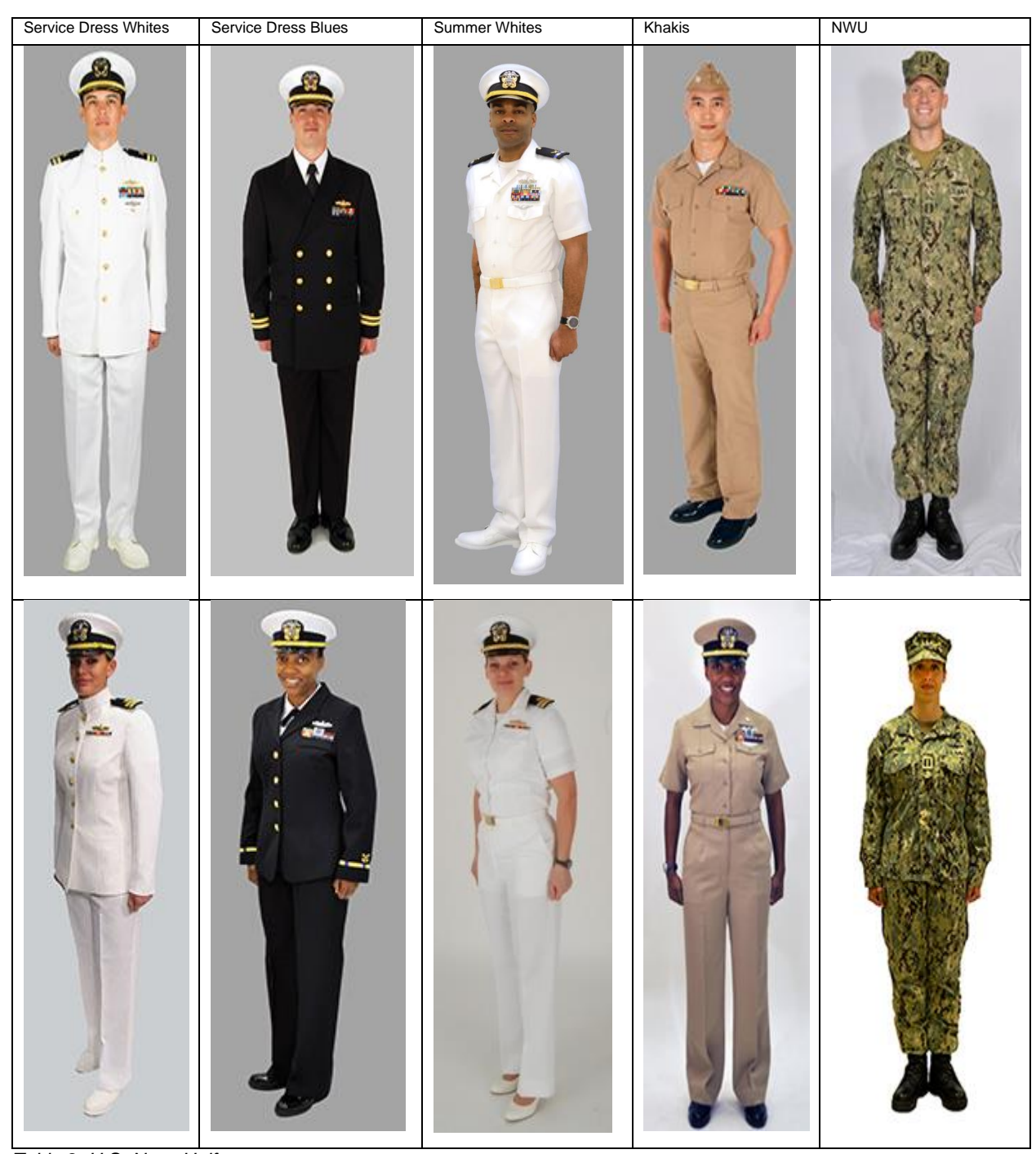
Table 2: U.S. Navy Uniforms