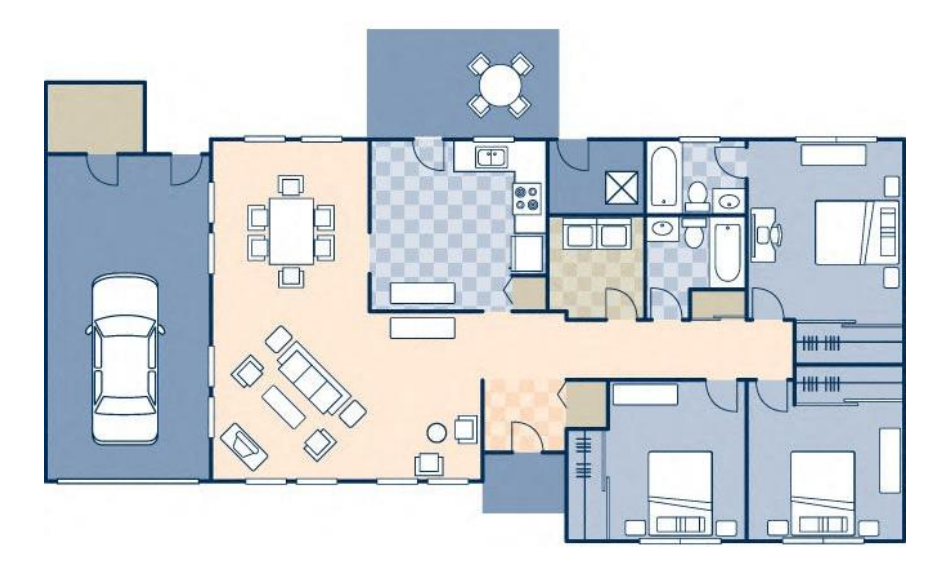
Figure 2: Sample Floorplan of a 3-Bedroom Home

All utility bills with the exception of your internet and cable television bill are included in your rent. The kitchen is equipped with a stove, refrigerator, cooking and eating utensils, and a clothes washer and dryer. Linens are at the expense of the officer. The cost of Government Housing is based on your rank.