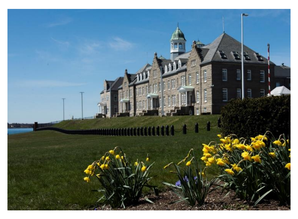
Figure 1: Luce Hall at the Naval War College

The U.S. Naval War College (NWC), located in Newport, Rhode Island, conducts six resident programs for officers. All branches of the U.S. Armed Forces are in attendance and are divided into different programs based on rank. Senior Officers (Commanders and Captains) attend the College of Naval Warfare (CNW), while junior officers (Lieutenant Commanders) attend the College of Naval Command and Staff (CNC&S). International officers make up the remaining four programs. The Naval Command College (NCC) for senior international officers (Commanders and Captains), the Naval Staff College (NSC) for mid-career officers (senior Lieutenant Commanders and junior Commanders), the Maritime Security and Governance Staff Course (MSGSC) and the International Maritime Staff Operators Course (IMSOC), both for mid-career officers.