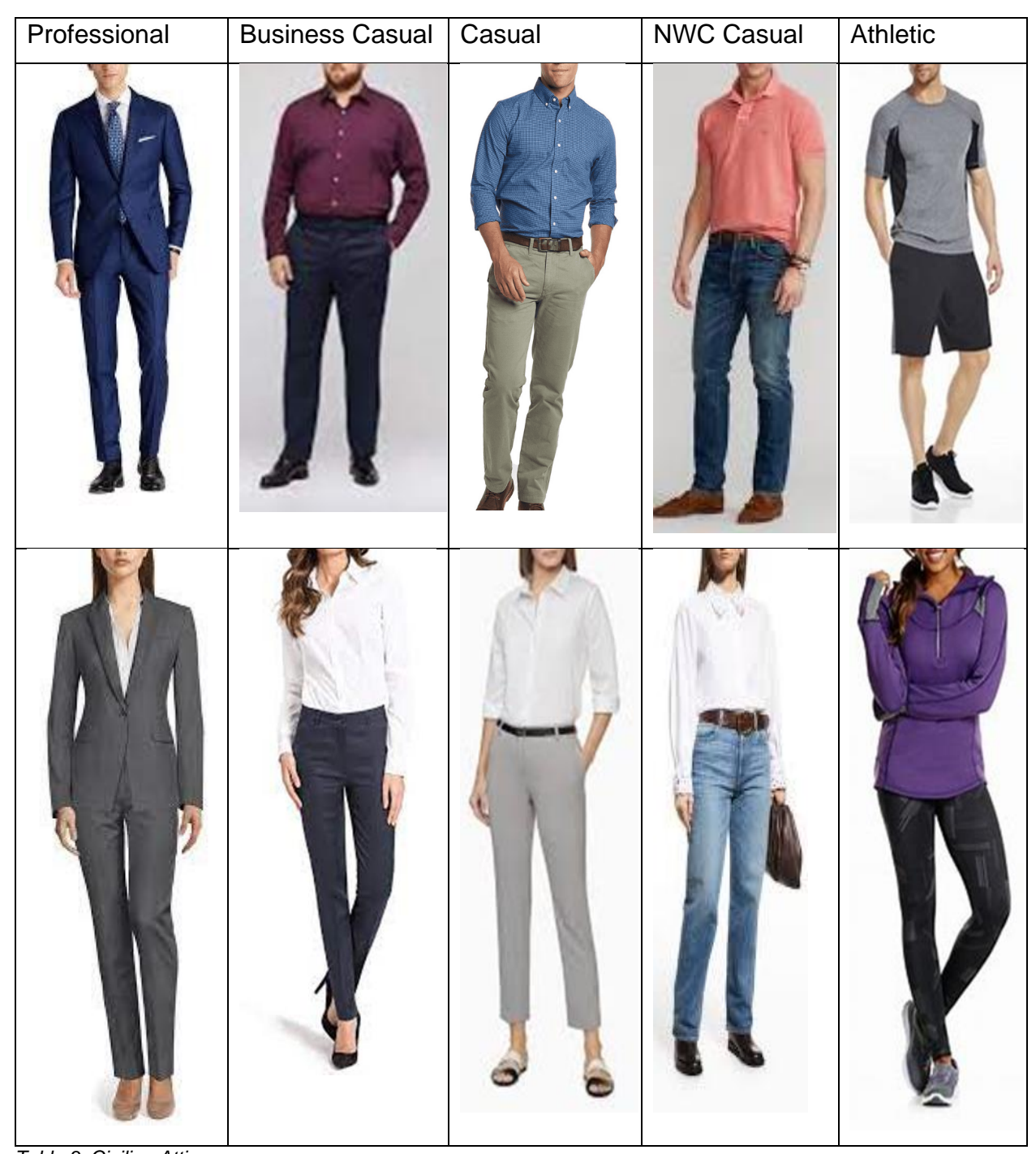
Table 3: Civilian Attire