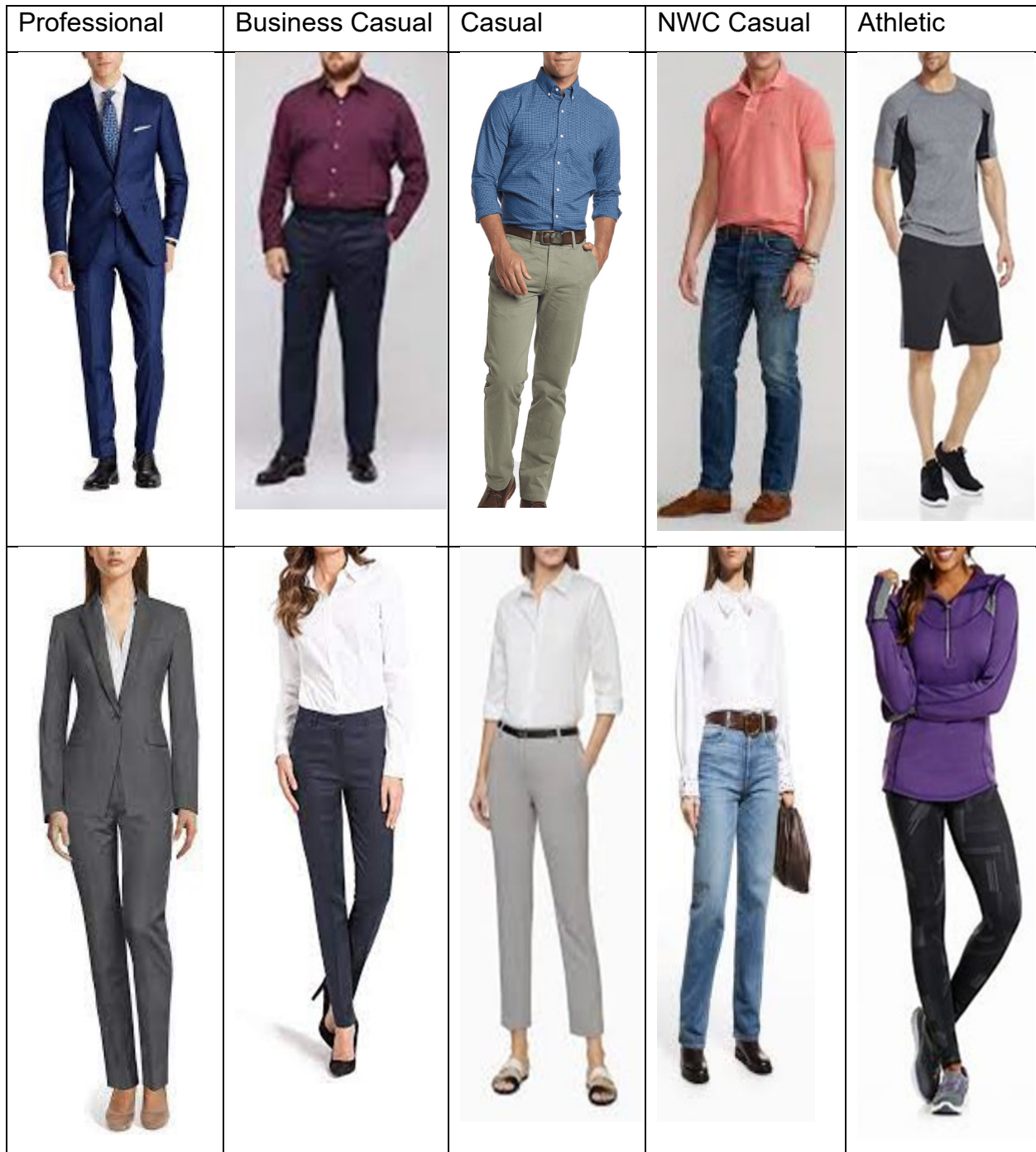
Table 3: Civilian Attire