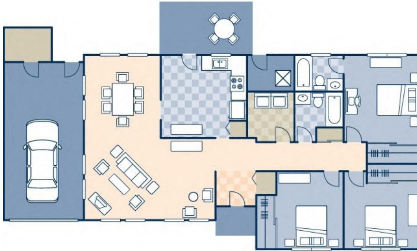
Figure 2: Sample Floorplan of a 3-Bedroom Home

All utility bills with the exception of your internet and cable television bill are included in your rent. The kitchen is equipped with a stove, refrigerator, cooking and eating utensils, and a clothes washer and dryer. Linens are at the expense of the officer. The cost of Government Housing is based on your rank.