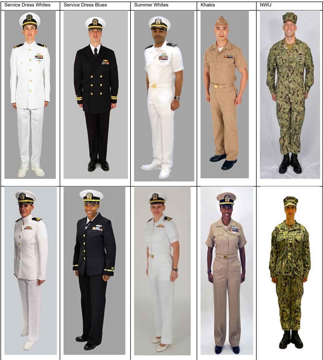
Table 2: U.S. Navy Uniforms