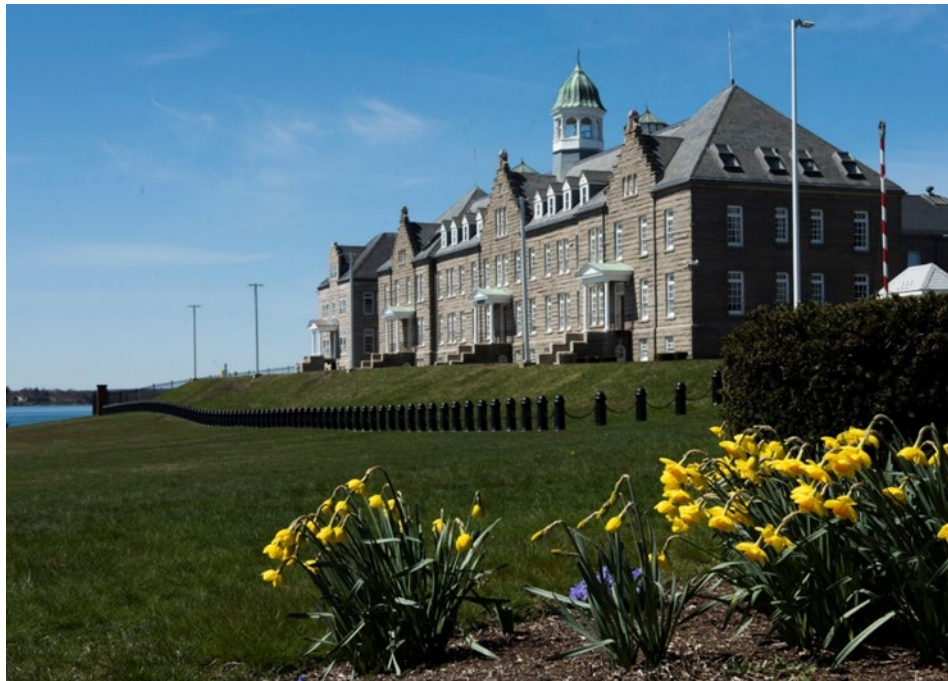
Figure 1: Luce Hall at the Naval War College

The Naval War College (NWC), located in Newport, Rhode Island, conducts six resident programs for officers. All branches of the U.S. Armed Forces are in attendance and are divided into different programs based on rank. Senior Officers (Commanders and Captains) attend the College of Naval Warfare (CNW), while junior officers (Lieutenant Commanders) attend the College of Naval Command and Staff (CNC&S). International officers make up the remaining four programs. The Naval Command College (NCC) for senior international officers (Commanders and Captains), the Naval Staff College (NSC) for mid-career officers (senior Lieutenant Commanders and junior Commanders), the Maritime Security and Governance Staff Course (MSGSC) and the International Maritime Staff Operators Course (IMSOC), both for mid-career officers.