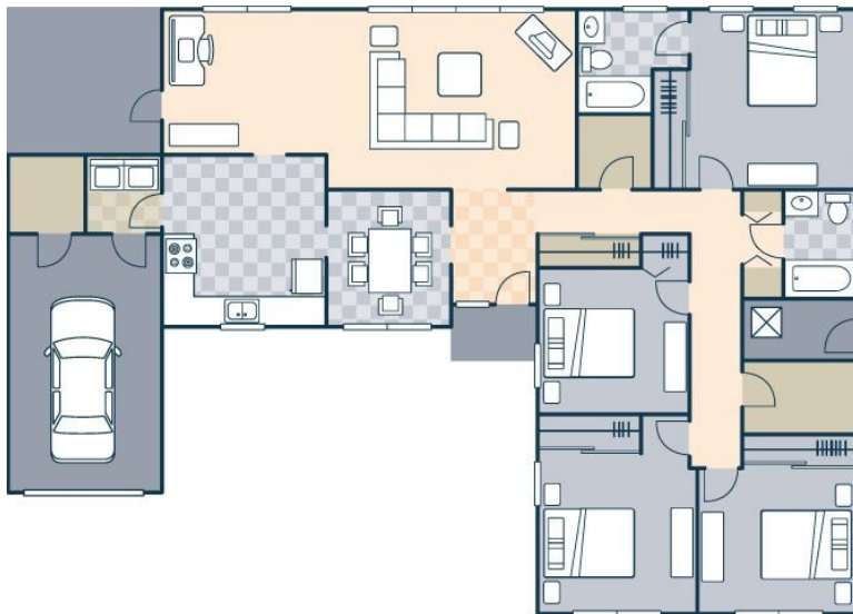
Figure 3: Sample Floorplan of a 4-Bedroom Home