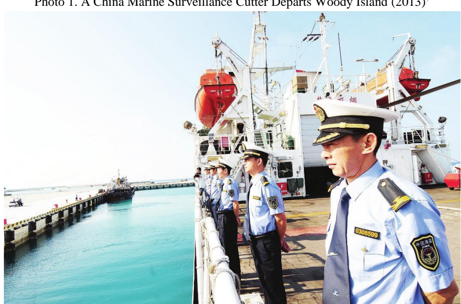
Photo 1. A China Marine Surveillance Cutter Departs Woody Island (2013)<sup>†</sup>