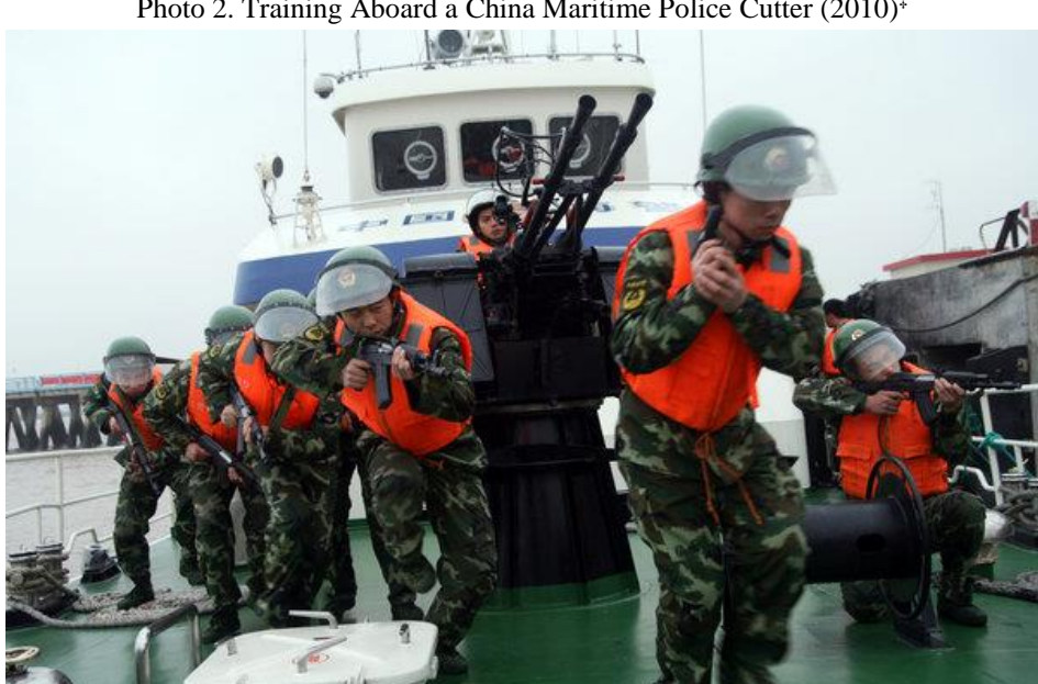
Photo 2. Training Aboard a China Maritime Police Cutter (2010)<sup>‡</sup>

Public security and anti-smuggling constituted the CMP's core missions. Unlike CMS and FLE personnel, CMP officers had police powers. 12 They could investigate, detain, arrest, and charge suspected violators of the Chinese criminal code. 13