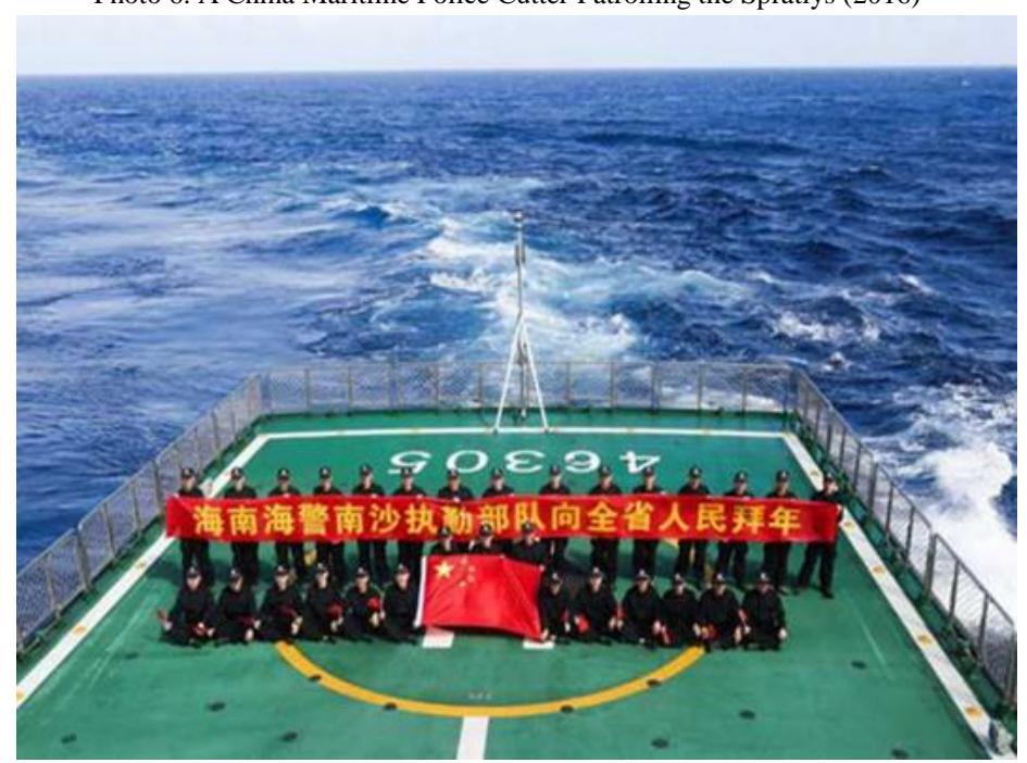
Photo 6. A China Maritime Police Cutter Patrolling the Spratlys (2016)<sup>‡‡</sup>

the Paracels. Now they sail to all Chinese-claimed waters. With responsibility for the two million square kilometers within the "nine-dashed line," the Hainan contingent has led the way. The 2<sup>nd</sup> detachment began deploying ships to the Spratlys sometime in 2015.<sup>38</sup> In early January 2017, CCG 46115 of the 2<sup>nd</sup> detachment sailed to the Spratlys for a several-week patrol.<sup>39</sup> The 3<sup>rd</sup> detachment is also active in the Spratly Archipelago. The 3,000 tonne CCG 46305 had conducted its first cruise of these remote claims by February 2016.<sup>40</sup> It now appears to operate there on a routine basis.<sup>41</sup>