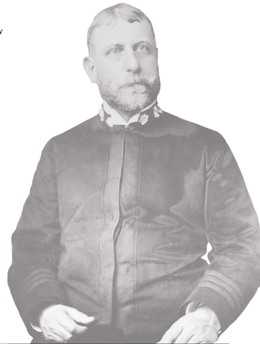
RADM Charles Herbert Stockton, USN

Stockton Center for International Law Center for Naval Warfare Studies 636 Cushing Road Newport, RI 02841 401-841-4949